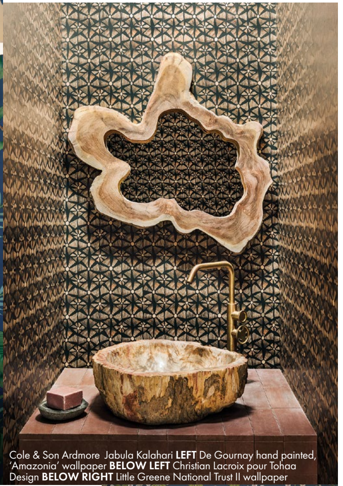
Cole & Son Ardmore Jabula Kalahari LEFT De Gournay hand painted, 'Amazonia' wallpaper BELOW LEFT Christian Lacroix pour Tohaa Design BELOW RIGHT Little Greene National Trust II wallpaper