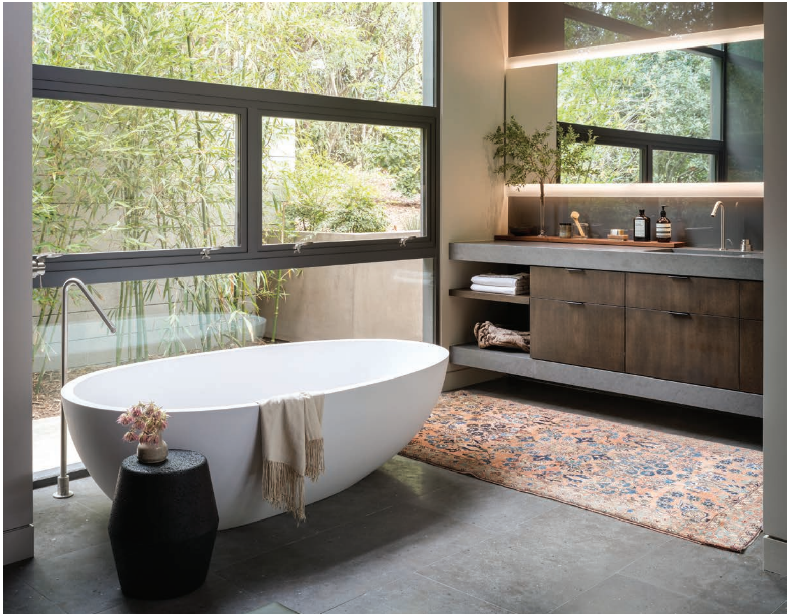
Agape Spoon XL tub. Tekka side table by Liaigre. Sarouk Persian rug.

owners' taste, interests and personal experiences, including the many midcentury furniture pieces and the Quadraflex mono speaker from the 1950s, echoing the couple's love for music. "You're able to find well-designed, high-quality pieces that are full of character yet are made of simple, comfortable materials that are not overly styled or gaudy," says