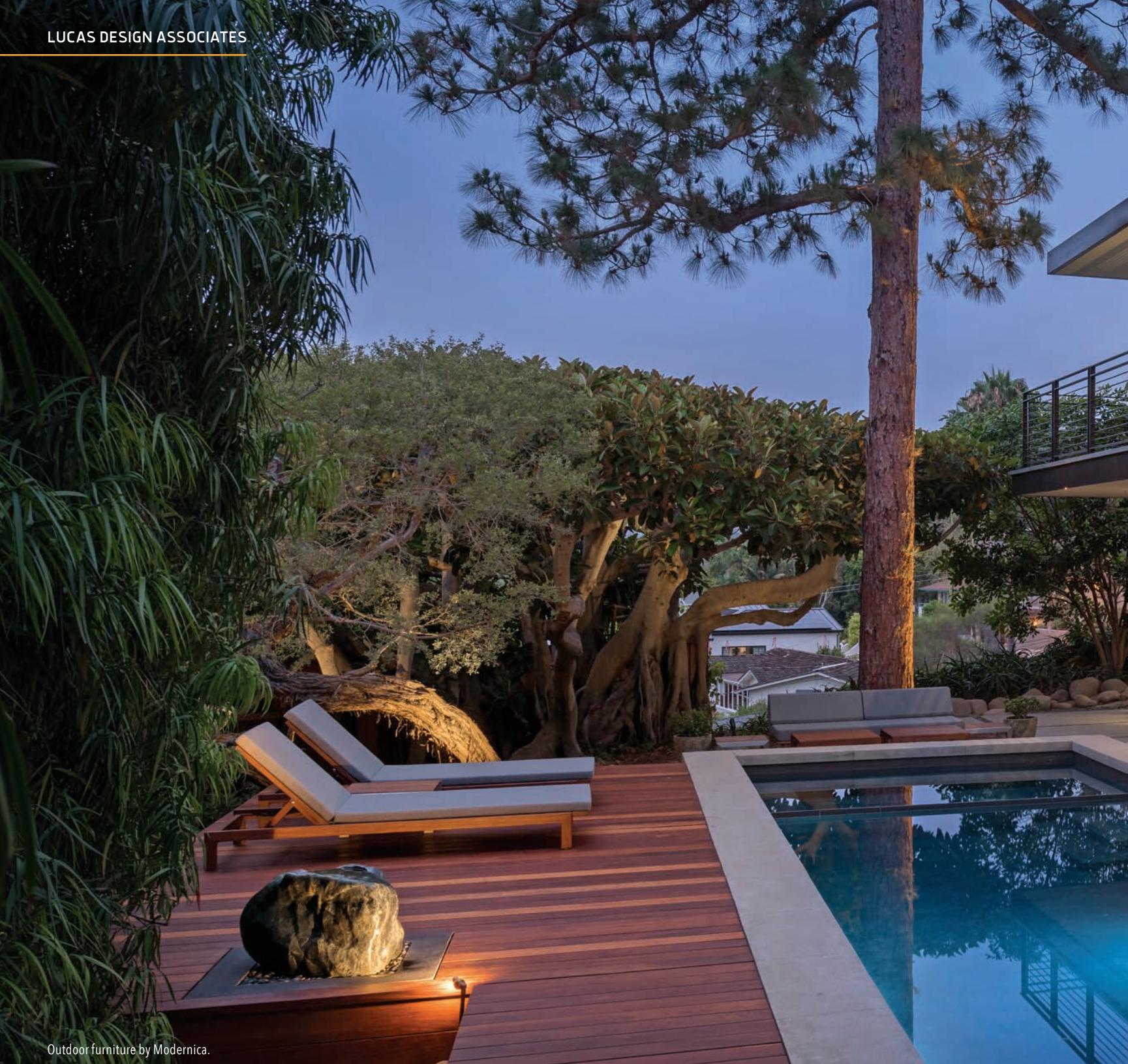
Outdoor furniture by Modernica.